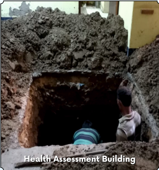
Health Assessment Building